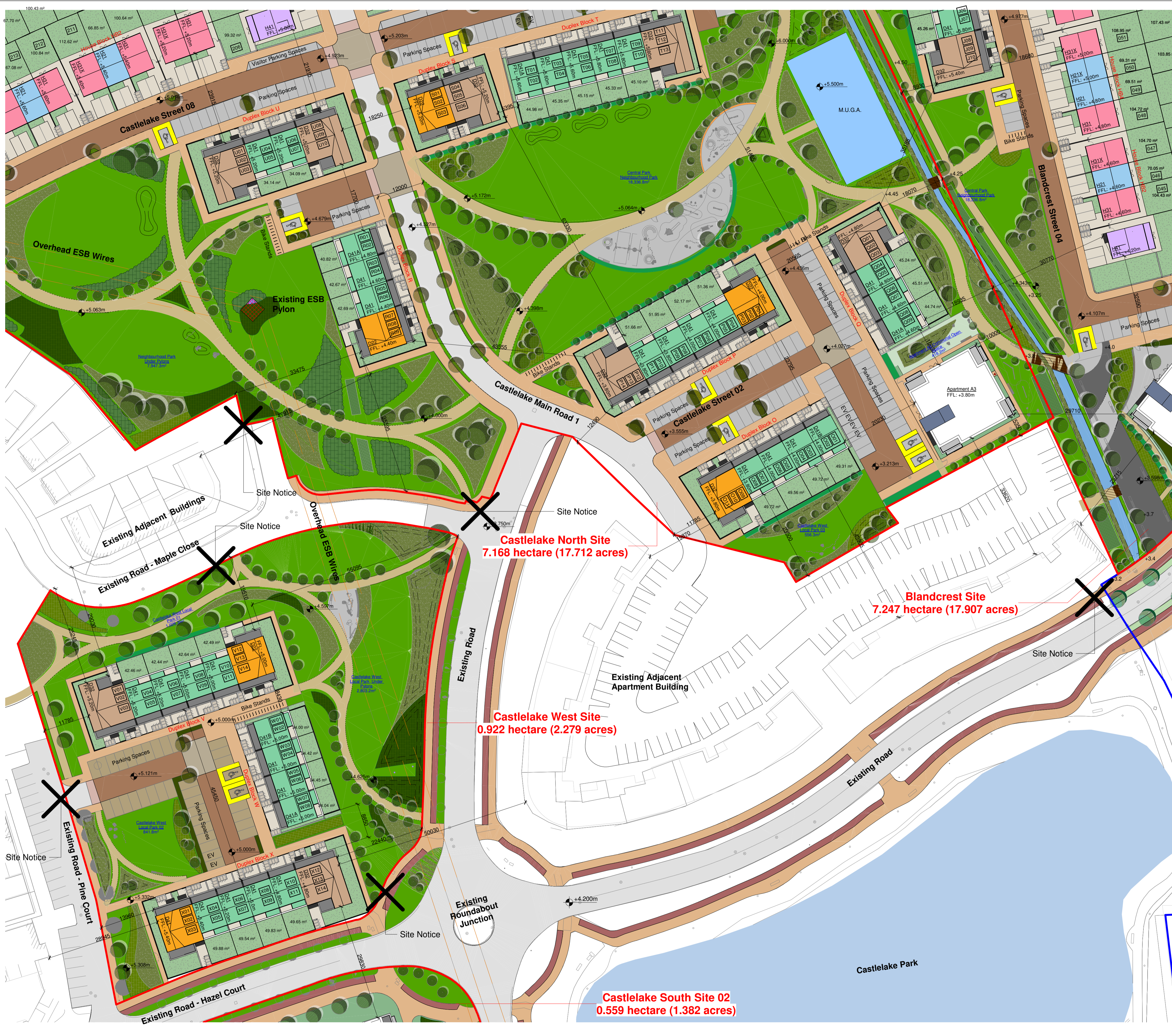
1 Proposed Site Layout Plan - Castlelake West 1 : 500